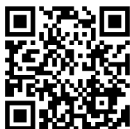
UW South Madison Partnership

To learn more about the Odyssey Project and UW South Madison Partnership, scan these barcodes with an electronic device, preferably a phone or tablet.